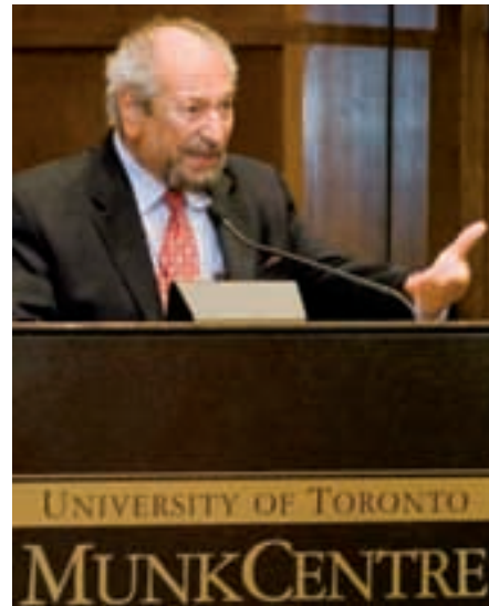
Saad Eddin Ibrahim: A broken leg for his efforts.

This second flowering of democracy ended, according to Ibrahim, when the state of Israel was established in 1949. "The newly independent Arab democracies rushed into war against Israel under pressure from the street and demagogues," he said. The Arab