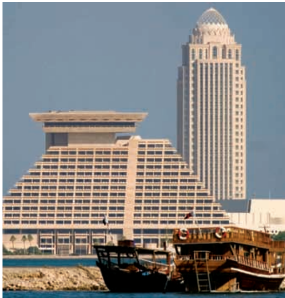
Doha, Qatar: Where the talks began with high hopes.

The Grand Bargain turned out to be a Bum Deal. There was far less opening in agriculture than expected, and the reduction of restrictions on textiles and clothing was back-loaded and more than offset by the impact of China. The South side of the deal required a major institutional upgrading and change in domestic regulatory and legal systems. Such changes take time and cost money. And they require advanced capabilities including high-skilled human