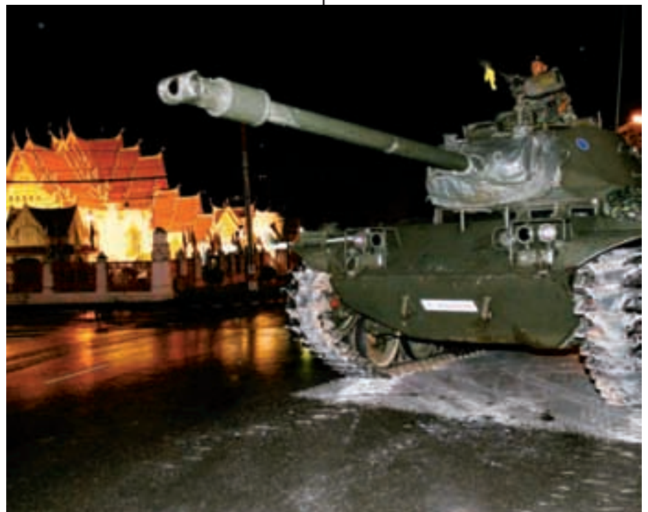
Thai armed soldiers with a tank park in front of Thailand’s famous marble temple.

The coup was the 18th in Thailand since the end of the Second World War, but the first since 1991. Coups are less common these days, Bertrand argued, because of stronger middle classes in develop-