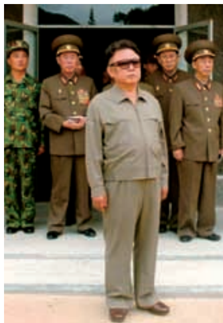
Kim Jong Il: Taking on the world.