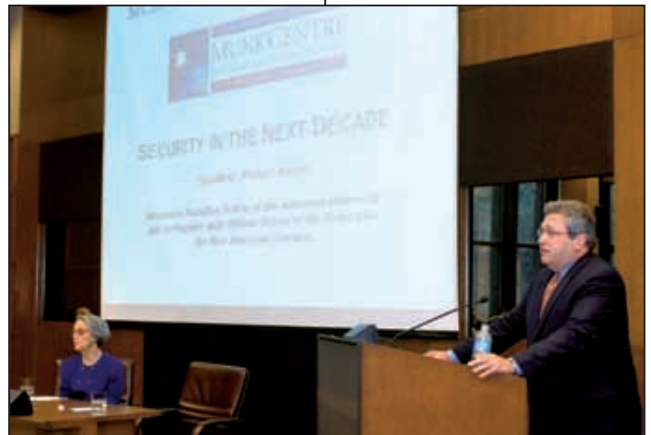
Robert Kagan: Nuclear proliferation and Islamic radicalism can be traced to the fall of the Soviet Union.

The iconoclastic historian believes that the US needs to fulfill its role as the international guarantor of global peace and stability. That mission, he says, can be traced back to the beginning of the Cold War. "The lesson of the Second World War," said Kagan, "was that no one else could be trusted."