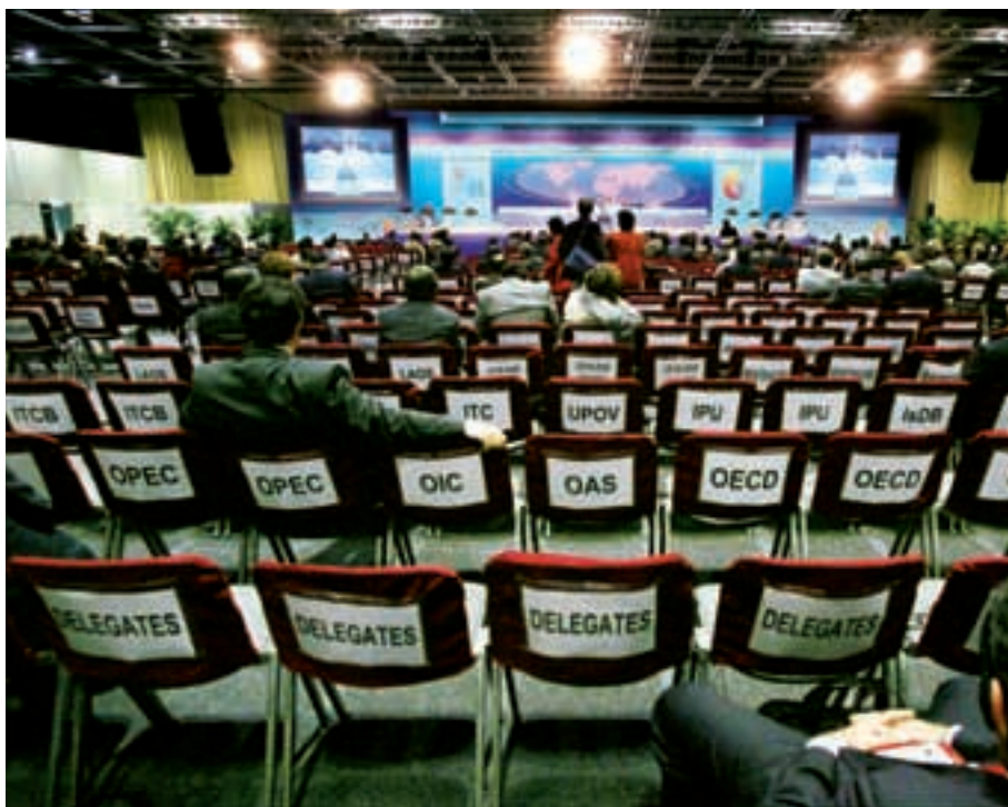
The Hong Kong WTO session: Nothing more to say.

The failure of Doha is not the failure of negotiations but the demise of rules-based multilateralism. A symptom of this demise was the desultory windup in early 2006 of the Hong Kong Ministerial Meeting of the Doha Round of World Trade Organization (WTO) trade negotiations. But the causes can be best understood by placing the Doha Round in historical context. Below, I provide an overview of key post-war developments in the multilateral trading system. I describe the emergence of the "new geography" based on coalitions of Southern countries and discuss the "fearful new world" of today's trade environment in which uncertainties have replaced any consensus approach to rules-based multilateralism. Finally, I address the need for reform and recommend a possible way forward for the WTO.